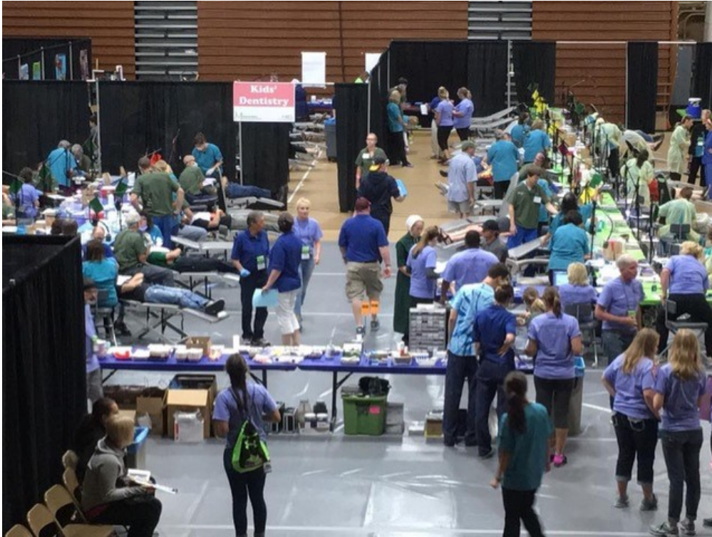
Mission of Mercy, Moorhead, 2016

Apple Tree Dental Children's Dental Services Community Dental Care HealthPartners Hennepin Healthcare Minnesota Association of Community Health Centers Minnesota Dental Association Minnesota Oral Health Coalition Normandale Community College Northern Dental Access Center Southern Heights Dental Group University of Minnesota School of Dentistry